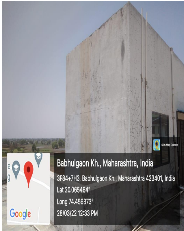
OVERHEAD water storage tank