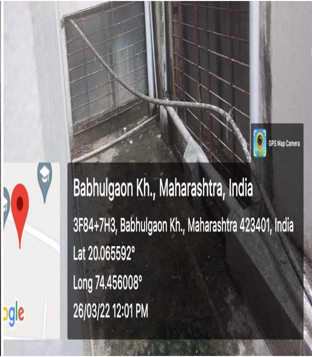
Water drain pipe