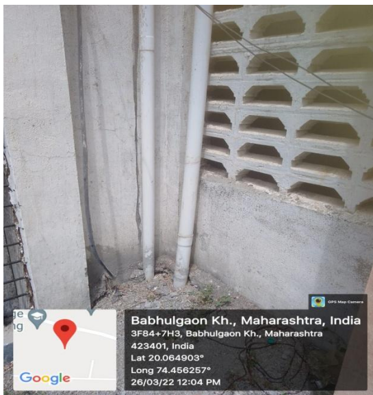
Rain water harvesting