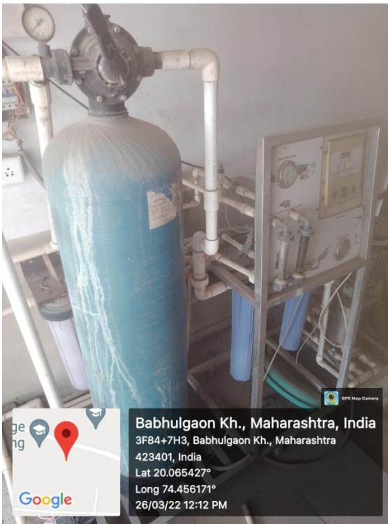
Water purification (RO)