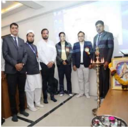
Lamp Lightening by Hon. Guests