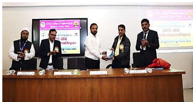
Felicitations of Hon. Guests