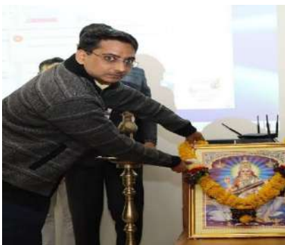
Shri Saraswati Pujan