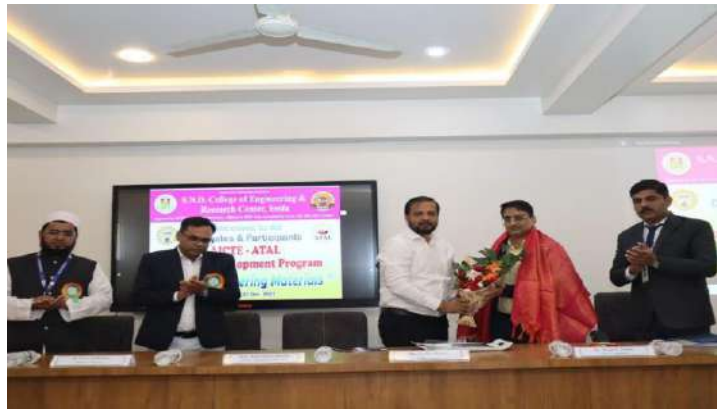
Felicitations of Hon. Guests